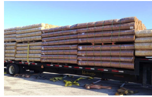
Erosion Control Blankets