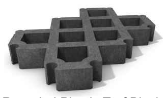
Recycled Plastic Turf Block