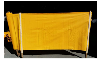
Staked Turbidity Barriers