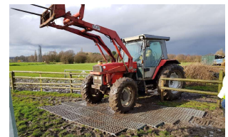
Mud Control Grids