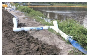
Link Log Manifold