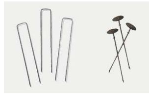
Staples & Pins