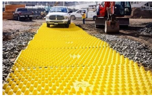
Trackout Control Mats