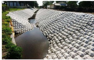
Fabric-Formed Concrete Mats