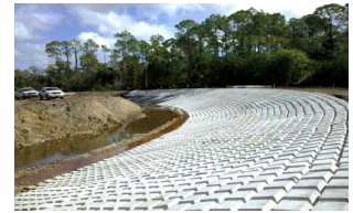
Articulating Concrete Blocks