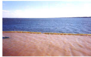
Floating Turbidity Barriers