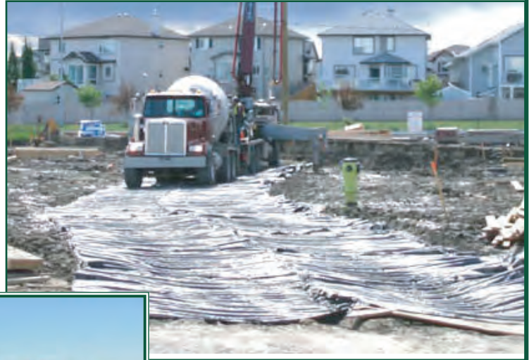
ALTERNATIVE TO ROCK ENTRANCES