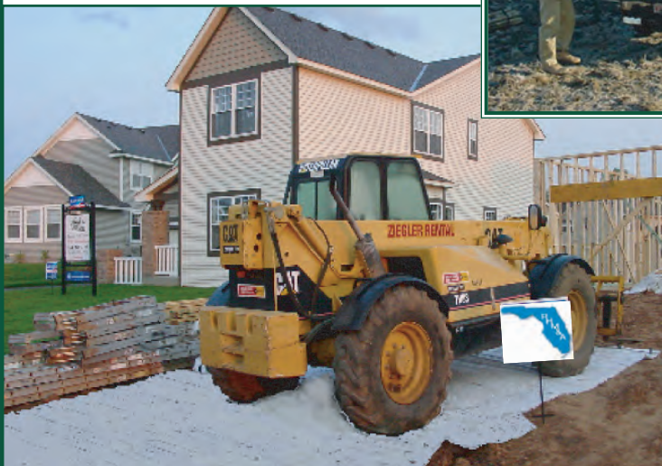
RESIDENTIAL CONSTRUCTION ENTRANCE