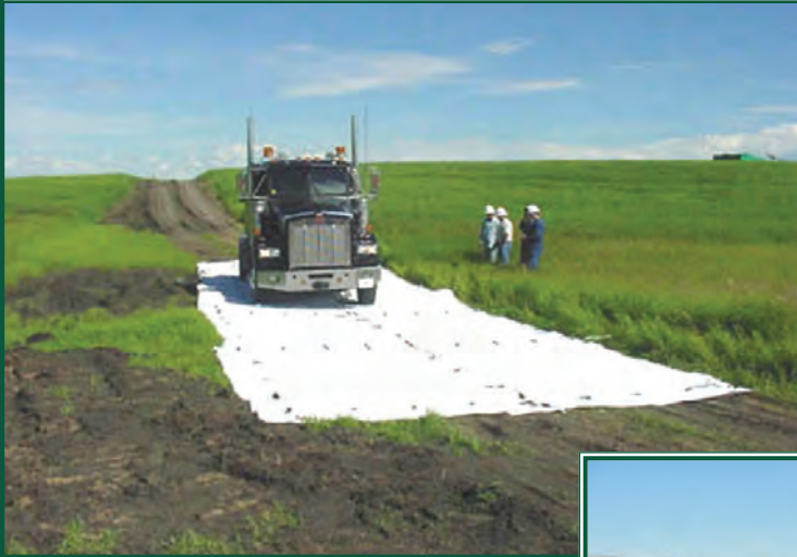
CROSSING SENSITIVE AREAS

A NEW revolutionary product to keep you out of the mud!